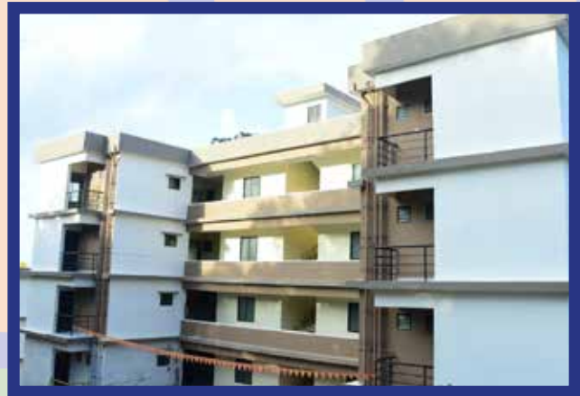
Granted Land for Construction of 500 flats for homeless under Pradhan Mantri Awas Yojana.