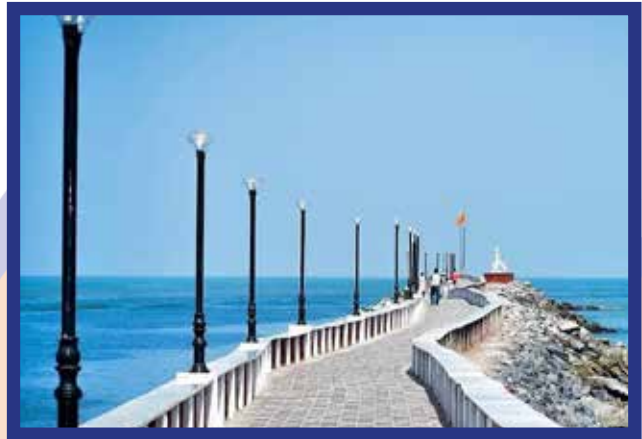
Introduced State's First Sea walkway point