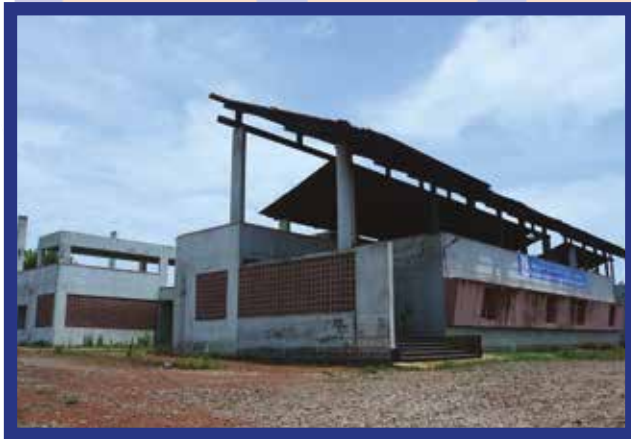
New Building for Diploma College of Agriculture at Brahmavar