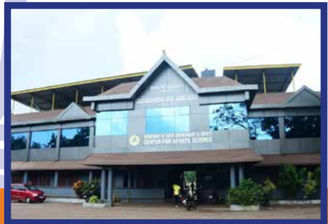
Sanctioned center for sports and science at Udupi