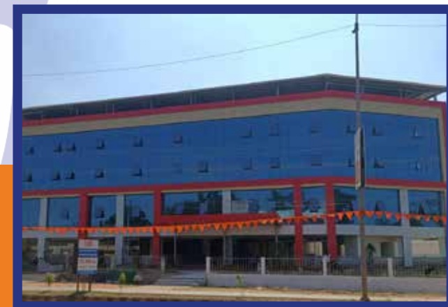
Sanctioned Land & Funds for Construction of KSRTC Bus Stand at Bannanje, Udupi