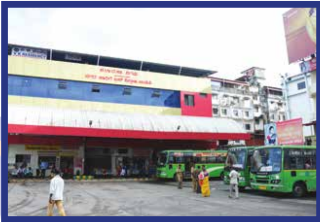
Introduced NURM Buses & Bus-stop at Udupi