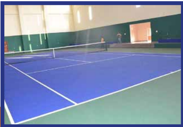
Introduced State’s First of its kind Sports arena with the first indoor lawn tennis court at Ajjarkad

He concentrated more on resolving all issues related to the basic necessity of a common person. His first vision is to provide houses, drinking water, electricity and roads for all. He has implemented many drinking water projects to resolve the constituency’s drinking water problems in this direction. Allotted sites, sanctioned notices, approved multi level apartments for houseless and economically weaker class people. He was instrumental in ensuring his constituency 24x7 uninterrupted power supply, the only taluk in Karnataka. He gave an impetus to strengthen and construct new educational facilities in the area to ensure quality education. Similarly, he strengthened the public health facilities in the district.