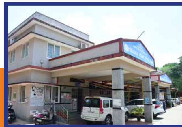
Upgradation of Brahmavar Government Hospital